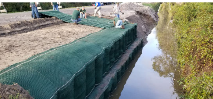
INSTALLATION 90 feet of SCOURLOK was installed along the ditch banks