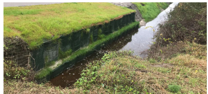
PERFORMANCE SCOURLOK provided a vegetated solution that cost much less than the traditional method of concrete bags