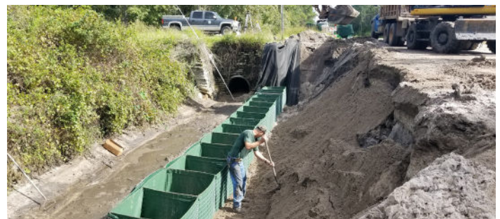
SOLUTION SCOURLOK® was chosen as it offers permanent bank stabilization and below water scour protection